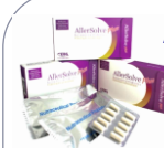
AllerSolve Plus® Probiotic V-cap

Provides astringent and calming touch to inflamed skin, especially suitable for acne or dermatitis. Often used together with 161K Hydrogel for better result.